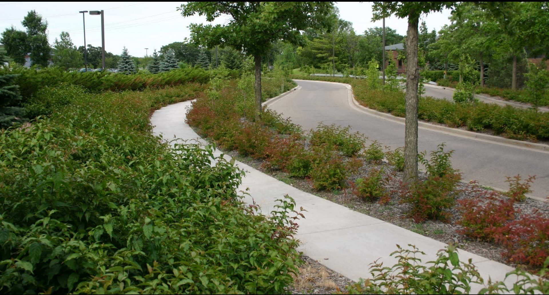
City of Minnetonka, MN, City Hall