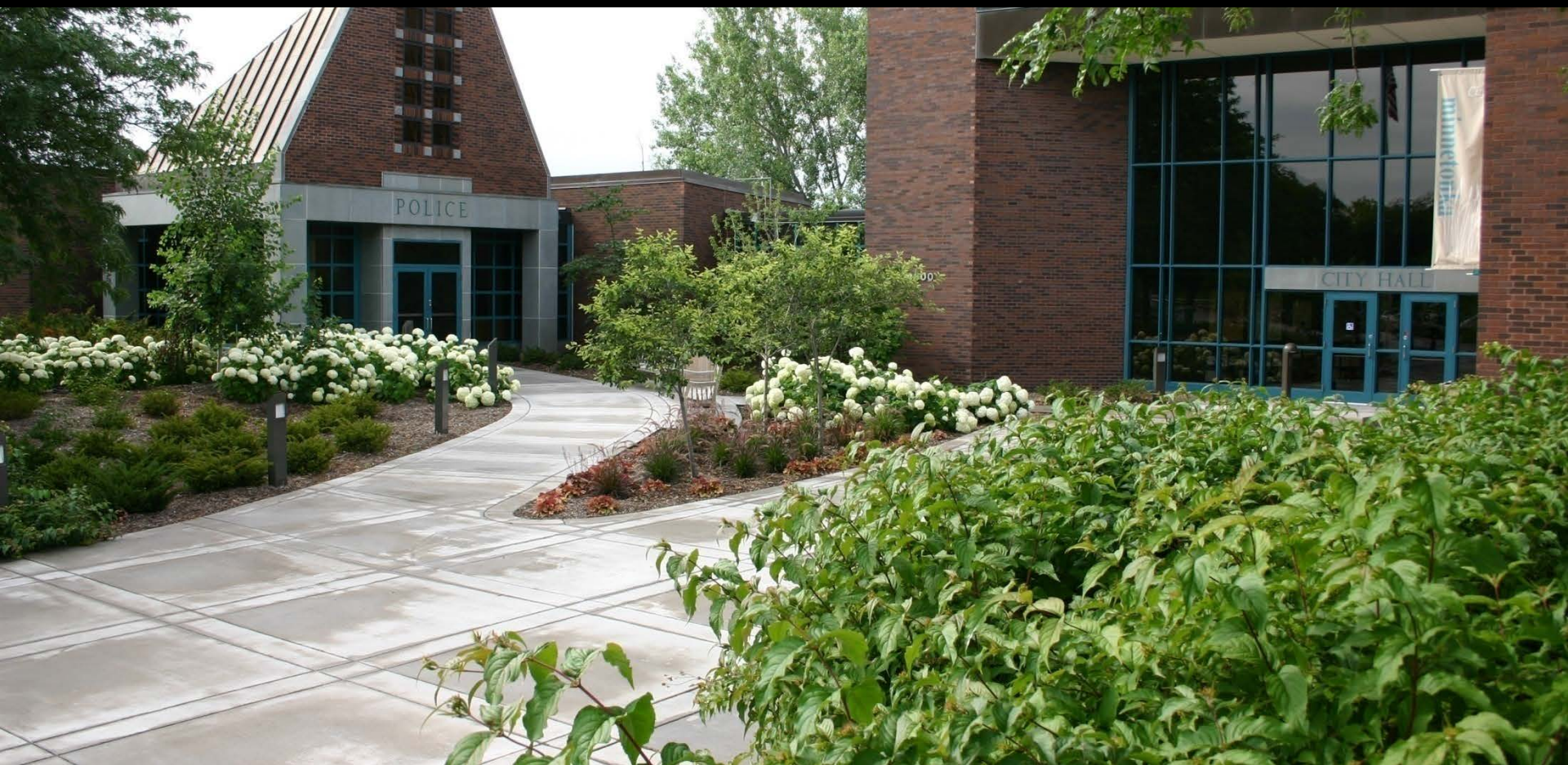
City of Minnetonka, MN, City Hall