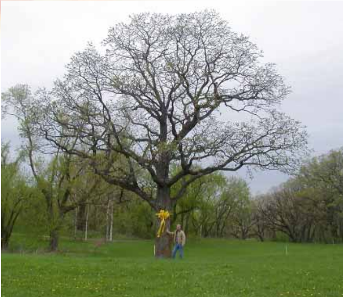
The ‘Granfather Tree’, Eagan

Properly cared for, they are valuable— and growing— assets . . .