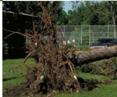
Weakness due to mproper planting procedure