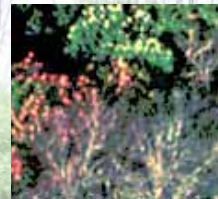
Oak wilt pocket